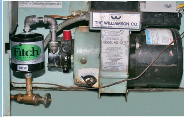
Typical Residential Installation

It has been approved and is being purchased for use by the US Armed Forces on a wide variety of applications.