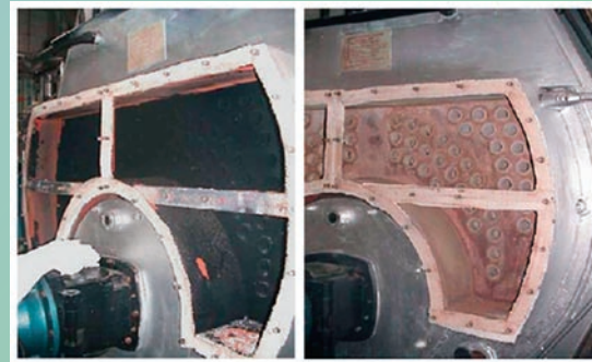
Before Fitch Installation